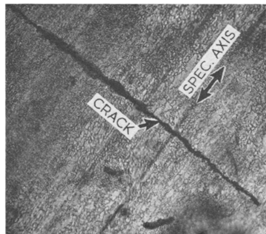
Figure 3 Crack propagation at 90° to specimen axis. Same specimen as shown in fig. 2 ( \times 233 ).