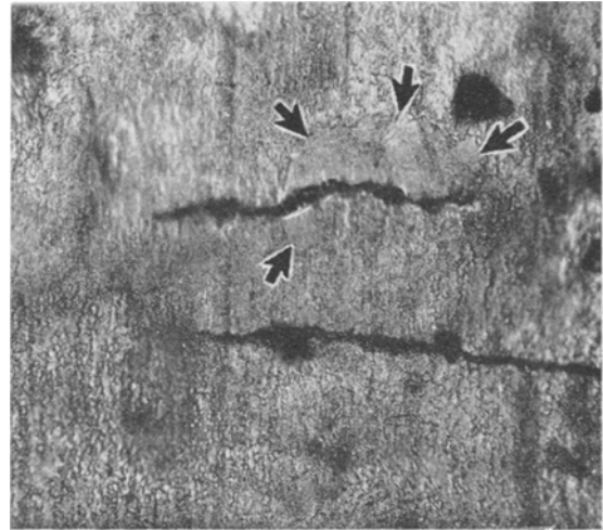
Figure 2 Grain growth associated with a small crack in DS lead fatigued to failure at 2.5 \times 10^6 cycles in air at a strain of \pm 0.145\% (chemically polished after failure) ( \times 233 ).

Observations made on the DS lead specimens which were fatigued in air to various fractions of